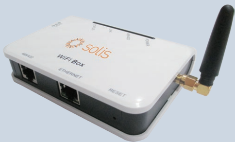
Data Logging Box DLB